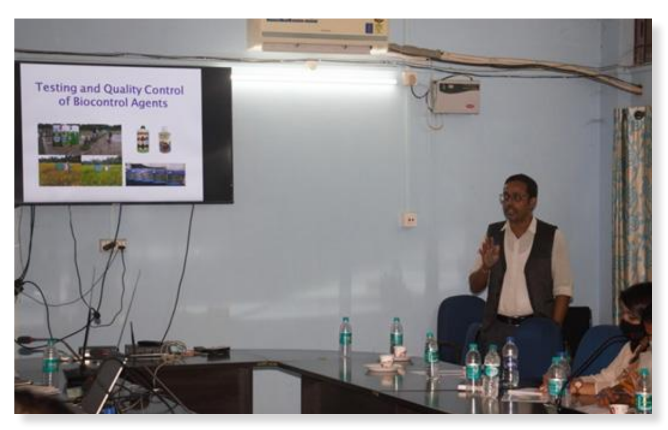
Technical session during the workshop

The workshop was followed by an open discussion on how to improve the pesticide testing scenario in Assam. The participants and the resource persons also visited the State Pesticide Testing Lab (SPTL) and State Bio Control Lab (SBCL), Ulubari, Guwahati.