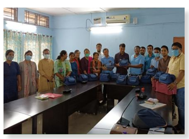
Participants of the Soil Testing Workshop

A Hands-on Training was organised by APART, ARIAS Society on "Soil and water-testing techniques with portable testing kit" for District