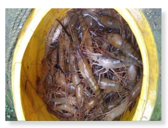
Prawns from Shambu's fishery pond

With a good market price, he sold 87 kg of freshwater prawn and was able to earn around Rs. 52,200/- from his pond sponsored under APART. Apart