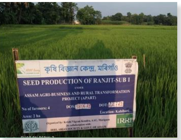
Seed production of BINA Dhan 11 and Ranjit-Sub1 with PooharAgro Producer Company Ltd., Manaha, Bhurbandha, Morigaon under KVK, Morigaon(Field photo)