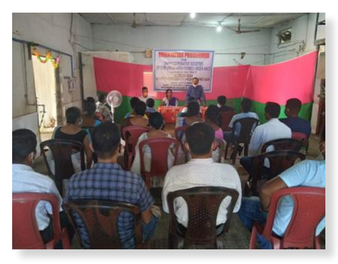
Awareness programme cum assessment of DCSs at Nagaon District, Assam.

A similar awareness programme cum assessment of DCSs was also organized for the members of DCSs of peri-urban areas of Darrang district on 28th September 2021 at Dairy Campus, Darrang, under APART Dairy Development Department. A total of 30 participants from 11 different DCSs attended the programme.