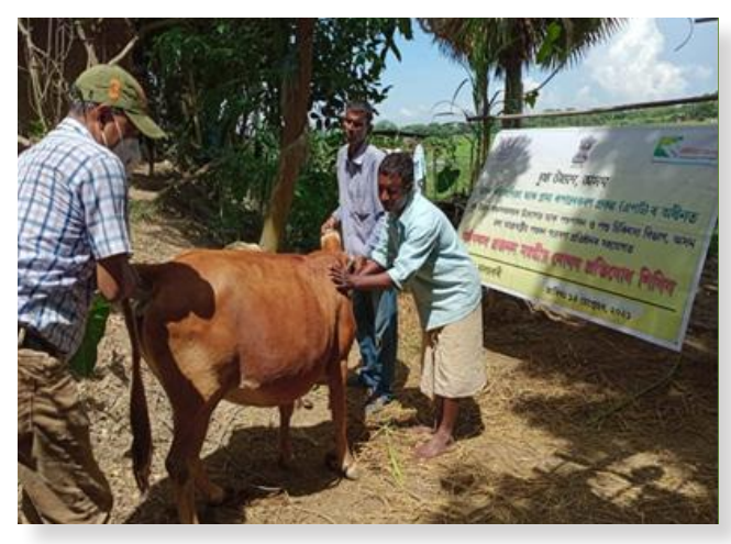
RHMM camp (2nd) at Maloibari

commercial) where efforts have been made through a well-designed process systematic improve to reproductivehealthandreducemastitis that is considered as economically the most important problem of dairy animals in Assam. Before the initiative, a baseline survey was conducted by ILRI, and a similar survey will be done at the end, to evaluate the outcome of this pilot initiative. A reproductive health camp is planned every three months, in each cluster, covering the targeted farming households. The changing process of reproductive health of the cattle will be tracked. and the outcome will be evaluated at the end of 1.5 years, to check the improvement in terms of increased