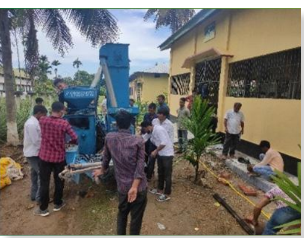
Repair and maintenance training on portable rice mill at Training Facility Centres, KVK Nagaon and Kamrup