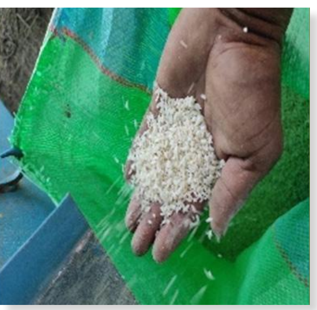
Assembling of portable rice mill and checking milling quality at Training Facility Centre, KVK Sonitpur