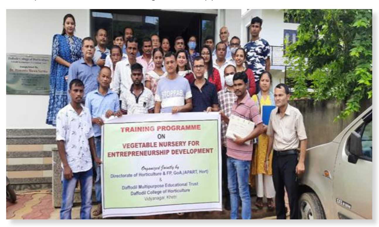
Training of Vegetable Nursery Entrepreneurs

Entrepreneurs have been trained, so far. The feedback from the participants is encouraging and they have started establishing nurseries. APART will be supporting in setting up the nursery enterprises by the provision technical support, practical training support and handholding advisory support.