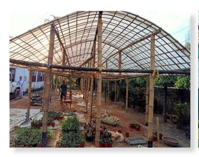
Low cost vegetable nursery constructed using locally available bamboo under construction

The Low-Cost Bamboo Based structure of the Nursery is cost-effective