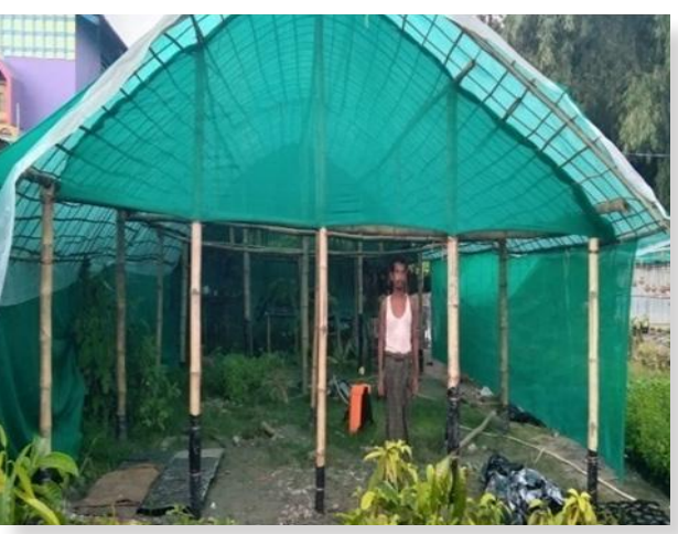
Low cost vegetable nursery constructed using locally available bamboo