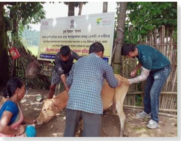
Reproductive health check up of cattle at farmers doorstep by qualified Veterinarians