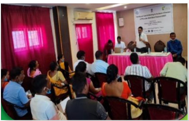
Capacity Building of FPCs