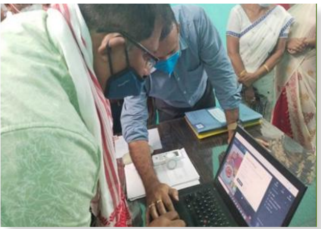
Launch of e-commerce website & AAROI