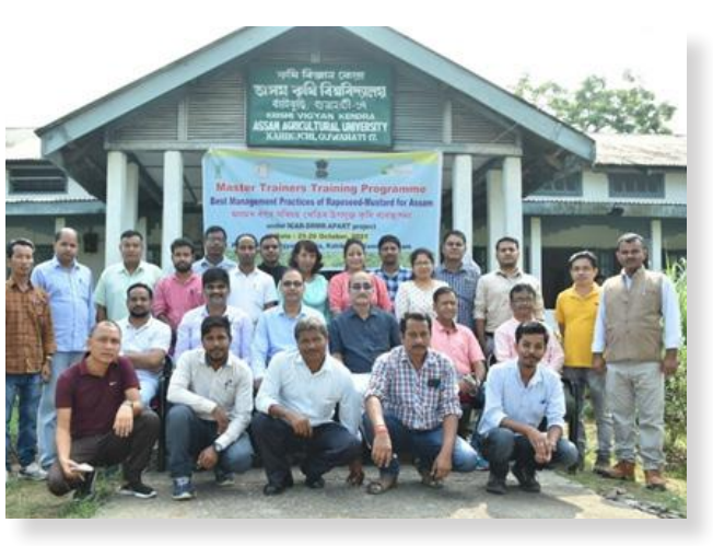
Participants during the Training of Trainers workshop at KVK, Kahikuchi, Kamrup

In this context, ICAR-Directorate of Rapeseed-Mustard Research, Bharatpur, Rajasthan in collaboration with OPIU-Agriculture, Directorate of Agriculture, Assam organized four training programmes of 2 days each (2 Master Trainers Training and 2