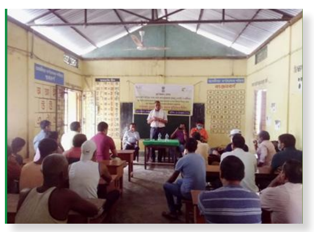
RHMM camp at Nortap, Kamrup (M) by D.V.O., Kamrup

The pilot initiative is planned to cover two clusters with 100 dairy farming households (smallholder and large