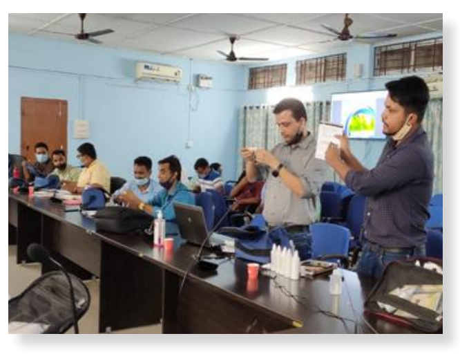
Practical demonstration during the Soil testing Workhsop

Environment Coordinators (DECs) of APART and Engineers from the Agriculture Department was held on September 27th 2021 at Chief Engineer Conference Hall, Agriculture Campus, Khanapara, Guwahati.